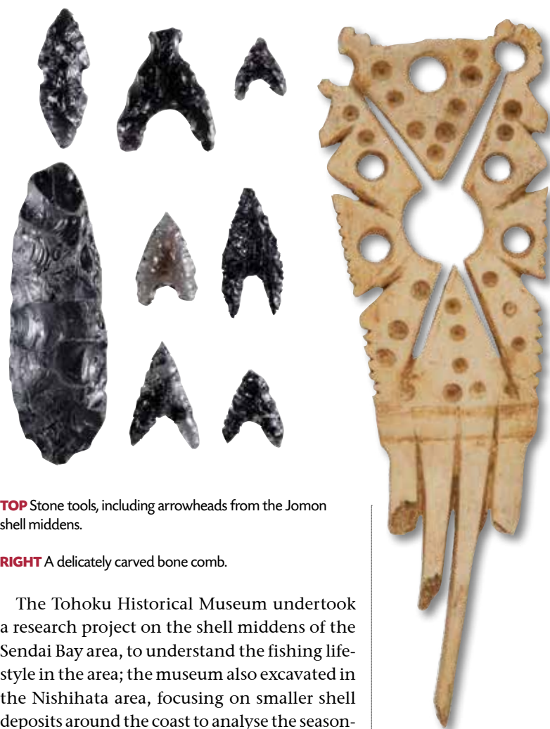
TOP Stone tools, including arrowheads from the Jomon shell middens.