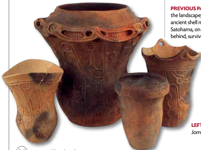
LEFT Examples of Jomon ware.

clarifying the later Jomon pottery sequence. More than 21 human burials, with ornaments and shallow bowls placed over their heads, were excavated in the Terashita area dating from the Final Jomon period; and, evidence from the Yayoi period (500 BC-AD 300) included pottery with seed impressions and iron implements, proving that rice agriculture in this region was accompanied by metal tools, as elsewhere in Japan. In the Sodekubo area, a number of headless crouched burials were excavated. Akanishi shells and several wild boar skulls – that were all facing towards a single stone – were discovered on the terrace, suggesting this was a location used for ritual purposes.